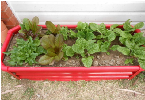
Vegetable & herb garden at Community Kids