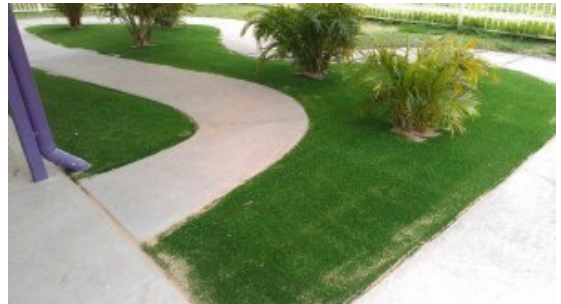
The revamped bike track and Nanango Childcare Centre